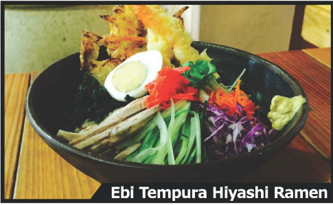
Ebi Tempura Hiyashi Ramen

Vegeterian Ramen [ベジタリアンラーメン] veggies and tofu in VEGETABLE broth ..... $16.50