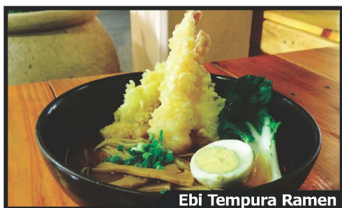
Ebi Tempura Ramen

Curry Ramen [ カレーラーメン ] with Japanese style chicken curry over noodles .... $16.50