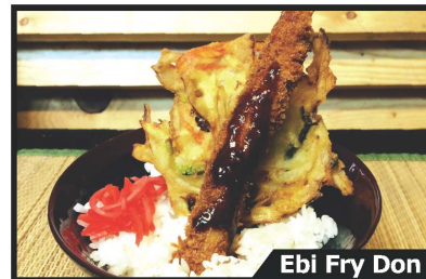
Ebi Fry Don