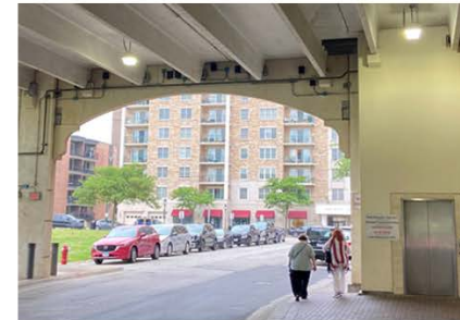
2. Vail Campbell Parking