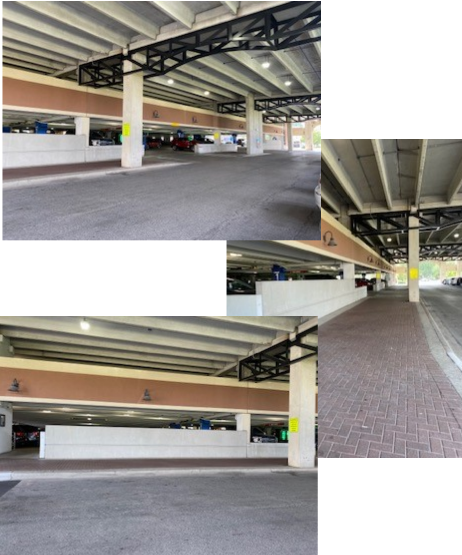
Vail Parking Garage