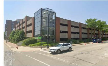
1. North Parking